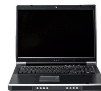
Engineering Workstation Receives Alarm and System Status Emails