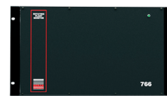
Beran PlantProtech™ Monitor Sends Alarm and System Status Emails

The Email Vibration Alert Interface monitors the alarm and/or system logs of any Beran PlantProtech™ Monitor. New log messages are sent via an Email server to a nominated Email address. Separate Emails are sent for each log monitored from each installed PlantProtech™ Monitor. The Email Vibration Alert Interface may be configured to check for new log entries between once every 5 minutes and once a day. Additionally a “summary” facility may be configured to resend all log messages once a day at a specified time or once a month on a specified day and time.